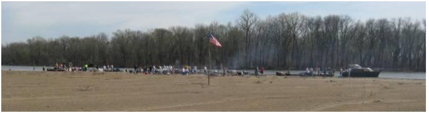
Only 45 Days to the John Boat Jamboree