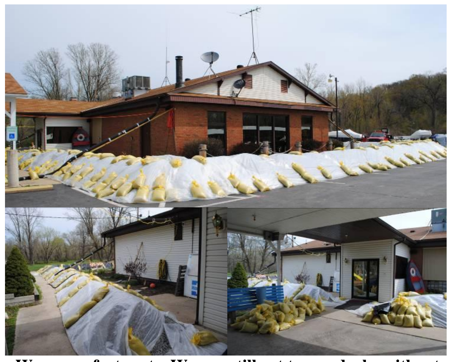
We are so fortunate. We can still get to our docks without too much trouble.