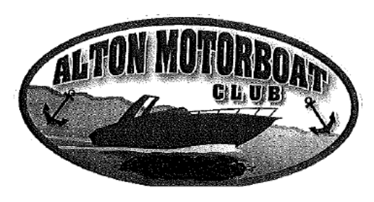
"The Best Little Boat Club on the Mississippi"